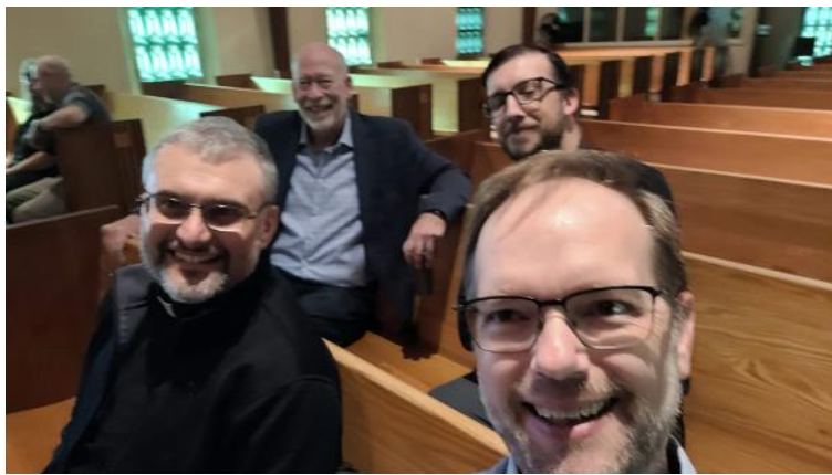
Top left: Montreal Forum Partners' meeting. Middle left: Police services' open house. Bottom left: Pastors of the LCC—Ottawa Circuit. Top right: Across from Ascension. Bottom right: Fall in Parc-Extension, Ascension steeple.