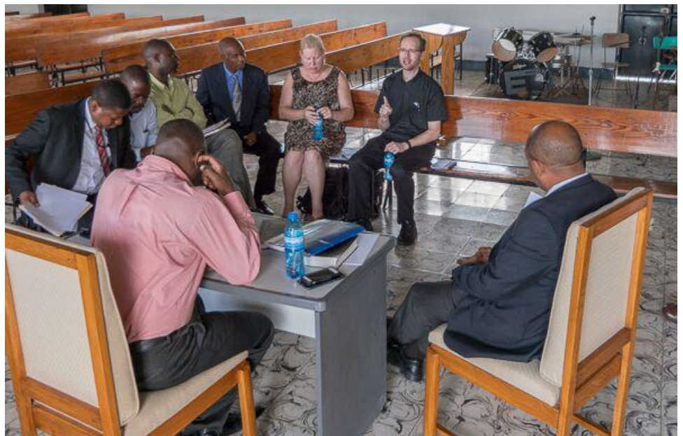
TOP LEFT: Some of the kids of Ascension; BOTTOM LEFT: Skating on Mount Royal; TOP RIGHT: Youth from Québec, Montréal and Ottawa gather at Ascension; BOTTOM RIGHT: Meeting with leaders of the Evangelical Lutheran Church in Haiti.